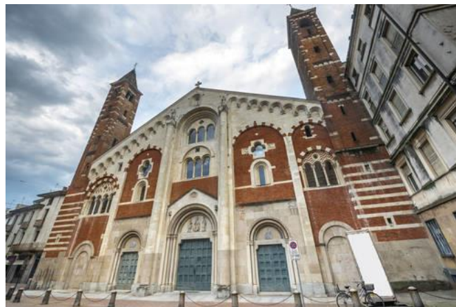
Casale Monferrato, Duomo | © ClaudioColombo/fotolia

2. The afternoon is dedicated to visiting the city of Casale Monferrato, the main center of business for the area. The Palaeologus dynasty ruled Monferrato from here before it came under the control of the Mantua-based Gonzaga family. The tour includes a visit to the Cathedral of Saint Evasio, patron saint of the city and the seminary library, established by Bishop Peter Jerome Cavaradossi in 1738, settled in its current location in 1838 and designed by Tommaso Audisio (1789-1845). As a special exception, the Church of Saint Micheal will be opened for this tour which concludes with a visit to the Church of San Domenico.