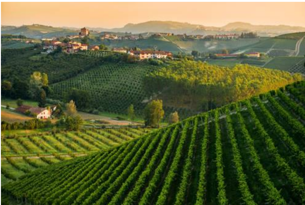
Monferrato landscape

Lower Monferrato, with its rolling hills, is famous for its vineyards which produce well-known wines such as Barbera and Grignolino. This is the part of Italy which is home to two world-famous special products: truffles and hazelnuts. Impressive are the many magnificent castles that dominate the nearby hills.